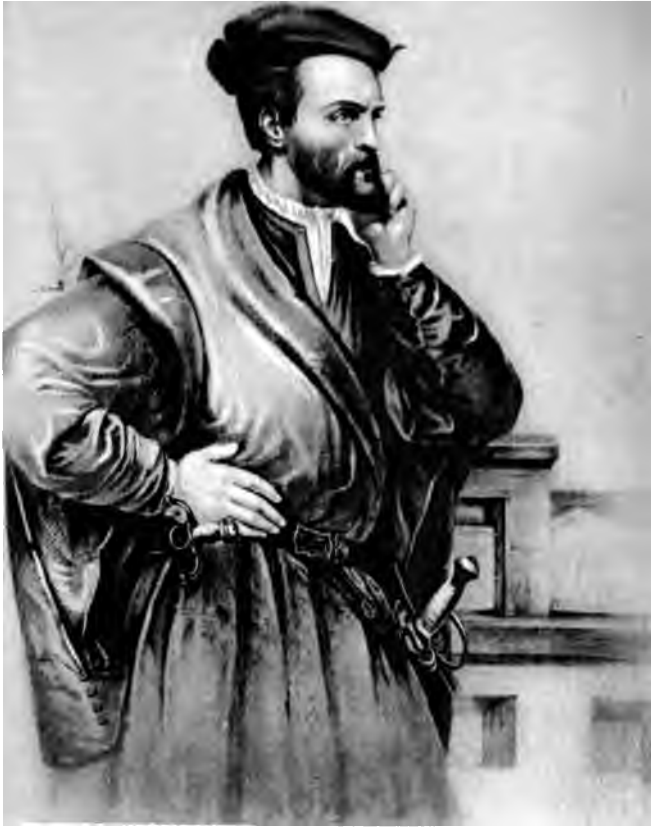
Portrait of a man in historical attire, possibly a soldier or noble, standing with a sword at his waist and a dagger in his hand.